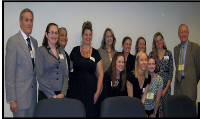
Community Justice Clinic Participants