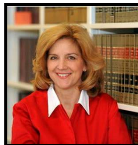
Judge Renee McElhaney