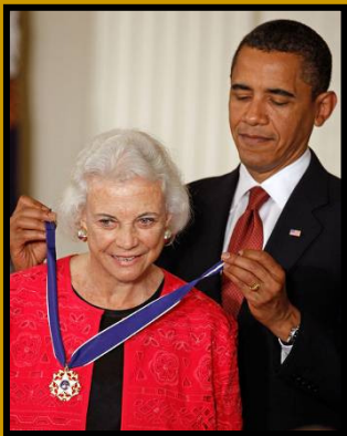
On August 12, 2009, O'Connor was awarded the Presidential Medal of Freedom, the highest civilian honor of the United States, by President Barack Obama.