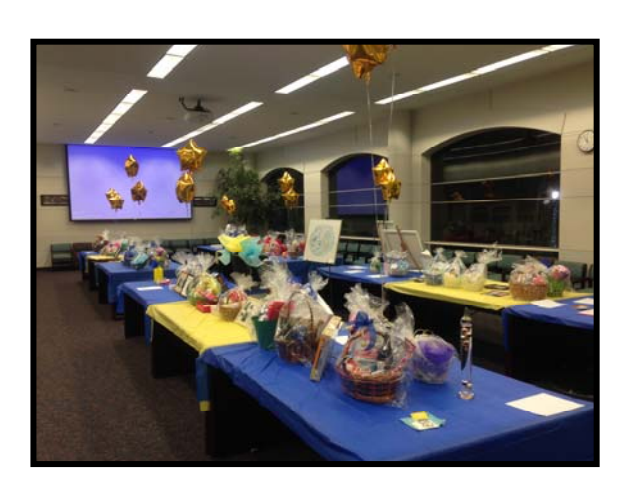
Auction Preview Morning