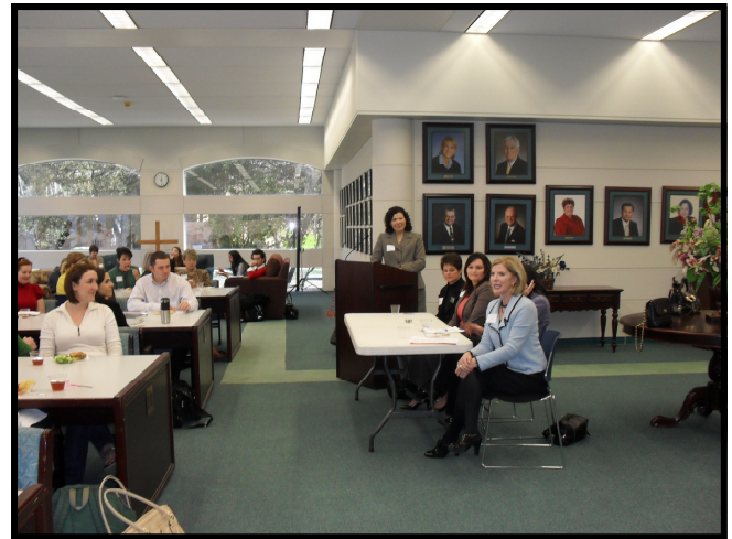
Students listened intently as panelists addressed work/life balance issues.