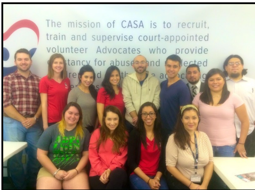
WLA & CASA members

The Women's Law Association will hold elections for our upcoming 2015-2016 board the first week of April. The new board will be announced at our wine and half-wit social on April 10th. The new board will hit the ground running in prepa-