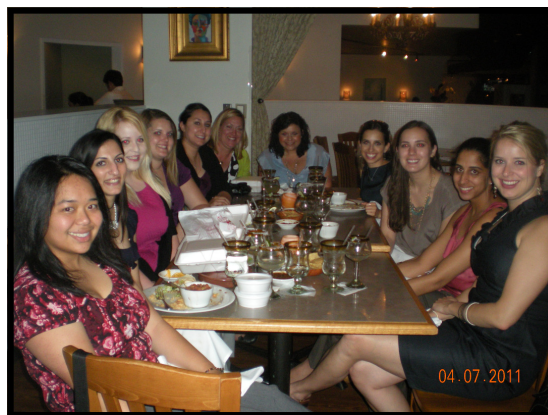
WLA "Old Board/New Board" exchange dinner