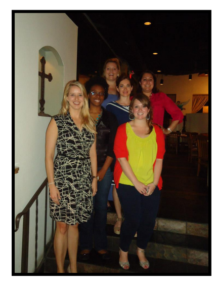
2012-13 Board Members