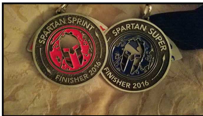
Gaylia Brunson completed the 2016 Spartan Sprint as a Super Finisher.