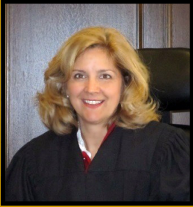
Judge Renee McElhaney