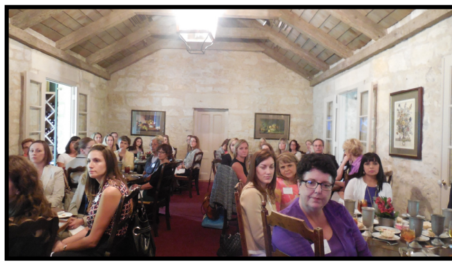
Attendees of the July luncheon