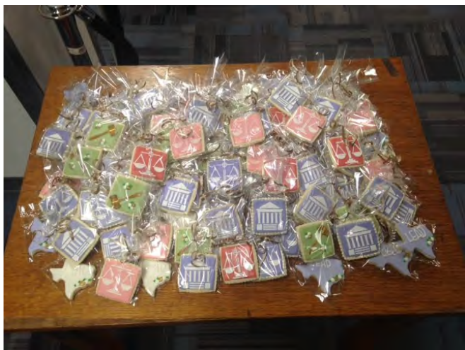
Cookies by Sweet & Salty Baking Co.