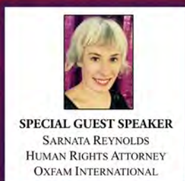
SPECIAL GUEST SPEAKER SARNATA REYNOLDS HUMAN RIGHTS ATTORNEY OXFAM INTERNATIONAL

Attorney: $115 | Non-attorney and Government Employee: $75 Immigration Volunteer: $30 | Student: $20 | STMU Faculty: FREE Register at www.immigration.scholarlawreview.org | 206.535.4053