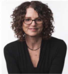
Robin DiAngelo Author, White Fragility

Join us for a discussion on how to grow past being uncomfortable discussing racism and its effects and how to lead through this discomfort.